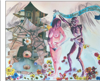
Death and The Maiden

Indian Government statistics show husbands and in-laws killed nearly 7,000 women in 2001 over inadequate dowries. Each dot counts a young bride killed for money.