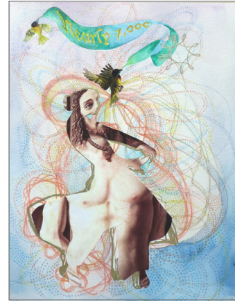
The Dance of Sheba III

Every 9 seconds a woman in the US is assaulted or battered. Hatches in the grass represent the number of women beaten up in the last ten minutes.